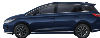
Ink Stone Blue