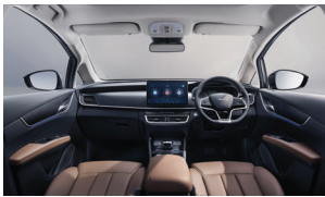
Black & Brown